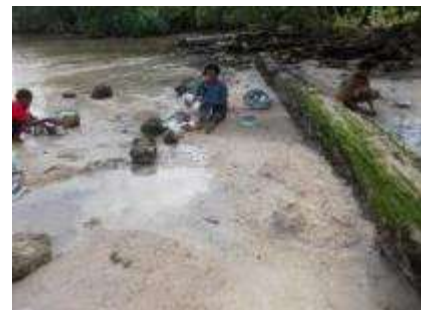
Digging for water during low tide