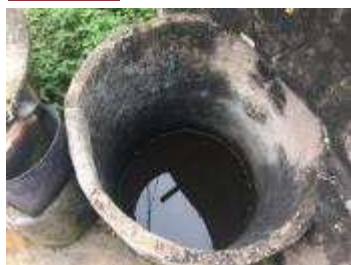
Water source, Dang Cao