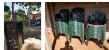
Speaker system and chairs