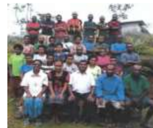
Students and staff of Emmaus Farm