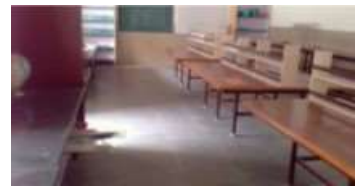
Completed: Chevalier Academy, Dindigul