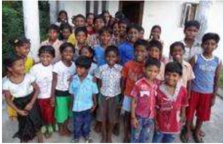
Completed: Disadvantaged youth, St. Anthony's Parish