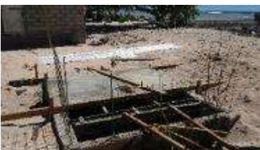
New toilet blocks