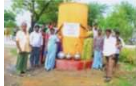
Completed: Our Lady of Fatima Parish