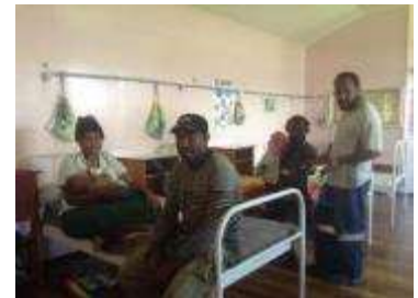
Ante-natal clinic, Yampu