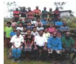
Students and staff of Emmaus Farm