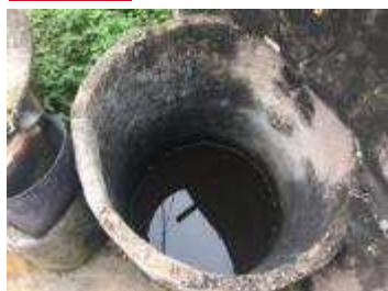
Water source, Dang Cao