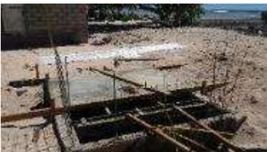
New toilet blocks