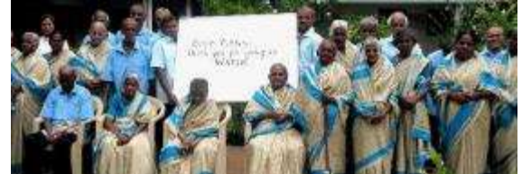
Completed: Arockia Anai Aged Care facility

There are so many people here in need so it is always difficult for us to know where to start. But clean water wells, tanks, support for disadvantaged youth, health programs and aged care can effect change to entire communities – it gives us great joy to see the difference we are making. So on behalf of Queen of Angels Parish, Joseph Nagar Village, St. John the Baptist Parish, Our Lady of Fatima Parish, St. Anthony's Parish, the community of Jyohi Nagar, Arockia Anai Home for the aged, St. Thomas School, and Chevalier Academy Dindigul; our heartfelt thanks to you and all your most generous donors. I hereby submit the following for your consideration at the next board meeting: