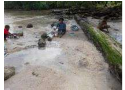
Digging for water during low tide