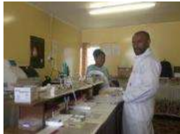
Power for medical equipment, Yampu Health Centre