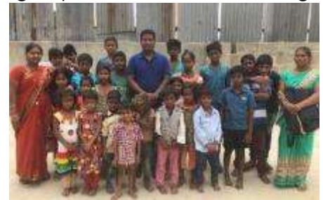
Children of Viveknagar slum

1. Viveknagar slum area, Bangalore: we are looking to offer education opportunities to the disadvantaged youth in this area, assisting with providing specialised teachers, blackboards and teaching aids, books, and stationery. This is a really poor area of Bangalore and these kids just need an opportunity to escape the cycle of poverty. 2. Our Lady of the Sacred Heart Parish, Agara, Bangalore: there are 500 families who are members of our parish. We would like to drill a bore well on our property so that there is a public water supply for these people residing near our parish. 3. Bore well and tank for the following villages: Alambadi, Gadenahally, Melakondur and Melavalai. As always, a thousand blessings for your generosity." – Fr. Irudayararaj MSC