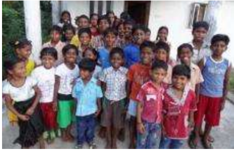
Completed: Disadvantaged youth, St. Anthony's Parish