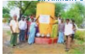
Completed: Our Lady of Fatima Parish