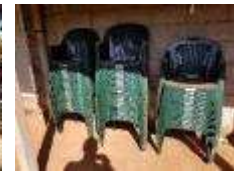
Speaker system and chairs