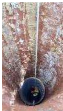
Well at Phục Sinh